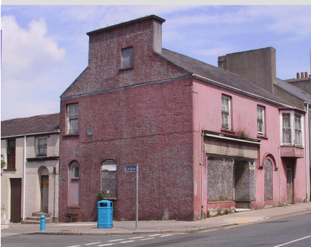
No 47 Bush Street Before Restoration

Works are also well advanced on No 20 Commercial Row (a former Tobacconist's shop) and No's 16/18 Dimond Street (a former television retail and repair business). Contractors will also begin on site at three other properties on Commercial Row this month.