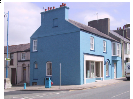
No 47 Bush Street After Restoration

Works are also well advanced on No 20 Commercial Row (a former Tobacconist's shop) and No's 16/18 Dimond Street (a former television retail and repair business). Contractors will also begin on site at three other properties on Commercial Row this month.